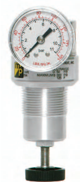
Model Shown: R57M-2G