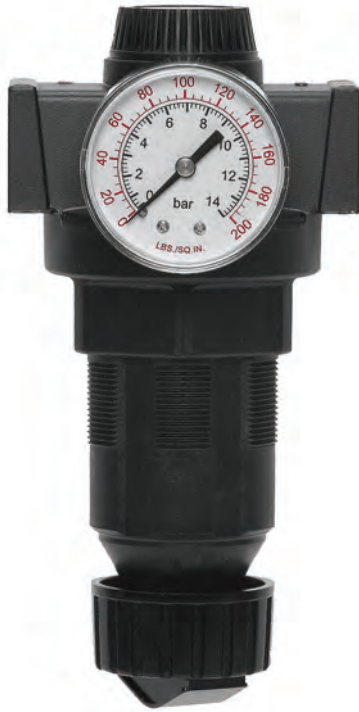
Model Shown: R100-6G