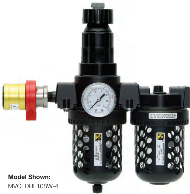
Model Shown: MVCFDRL108W-4